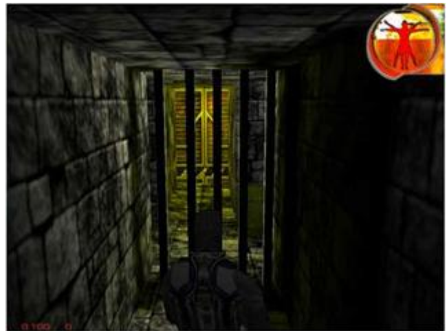
Tunnel – Second Level