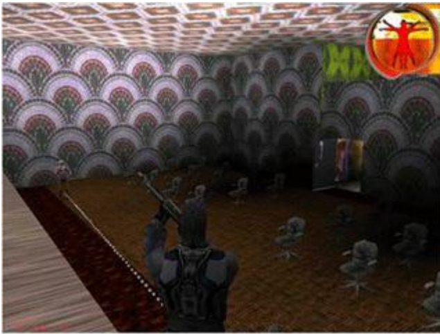
Auditorium – Seventh Level