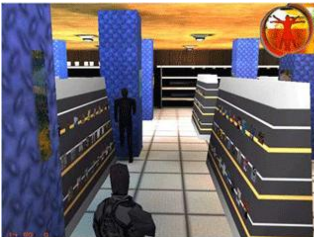
Basement – Third Level