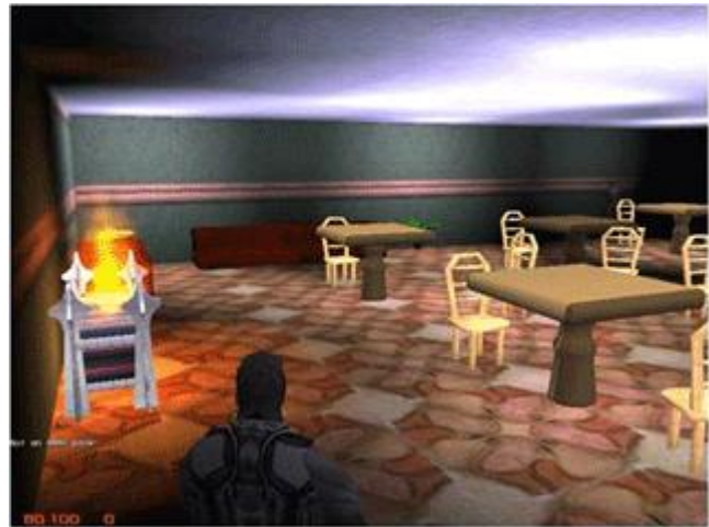
Restaurant & Bar – Sixth Level