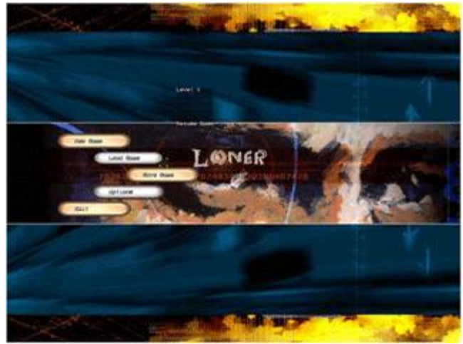
Menu of the game