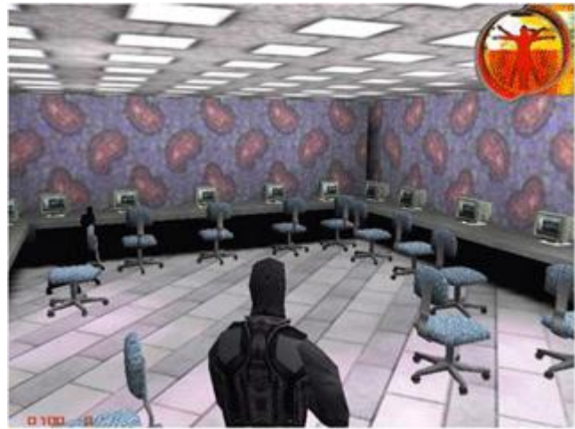
Computer Facility - Final Level