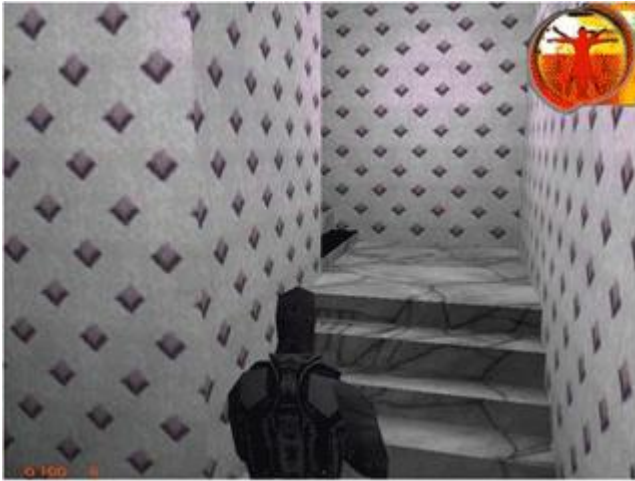
Stairs – Fourth Level