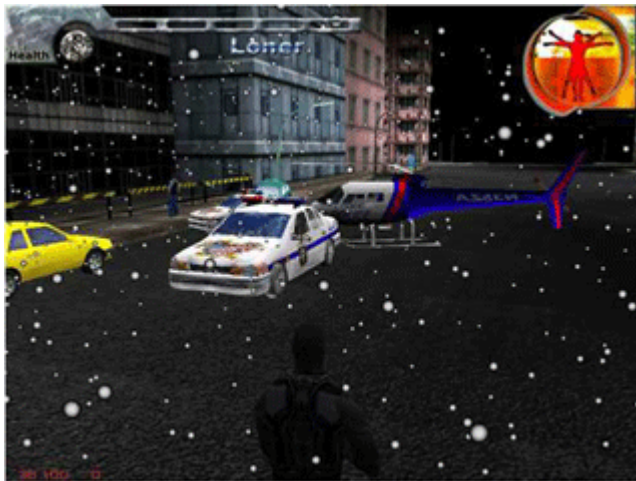
Street – First Level