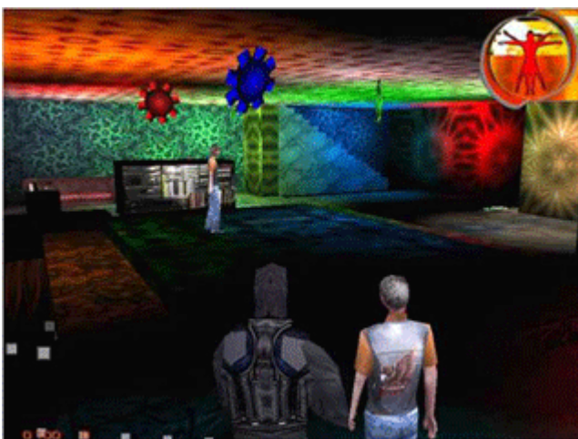
Discotheque – Seventh Level