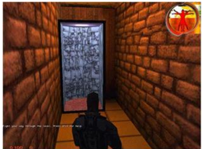
Lift – Fourth Level