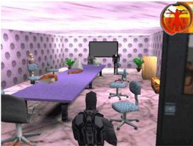
Office 2 – Fifth Level