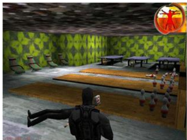
Bowling and Gambling Den – Seventh Level