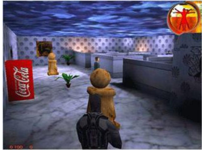
Office 1 – Fifth Level